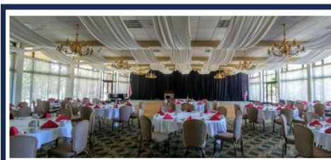
Northridge Country Club 7600 Madison Ave. Fair Oaks, CA

https://www.aauwroselillesouthplacer.org/events