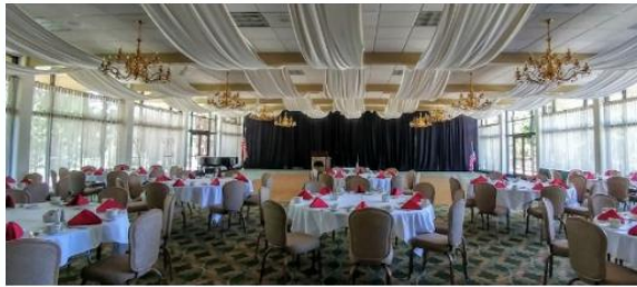
North Ridge Country Club, 7600 Madison Ave. Fair Oaks